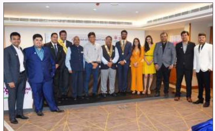
RC Hyderabad EWoKE