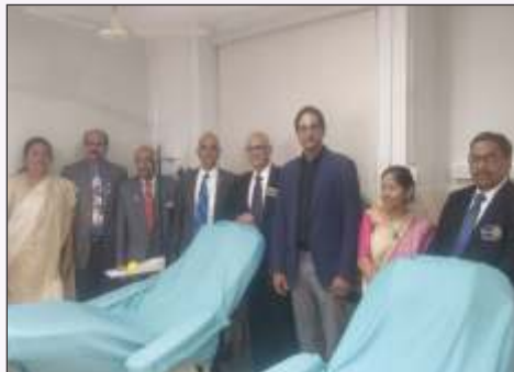
Reopening of Challa Blood bank RC Hyderabad Deccan