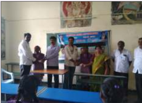
Distribution of Spectacles RC Martur