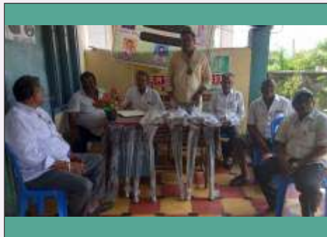
Distribution of Walking sticks RC Parchur Central