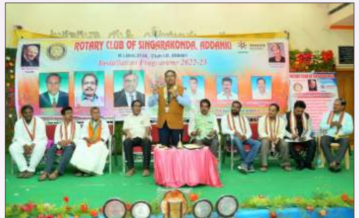
RC Singarakonda Addanki