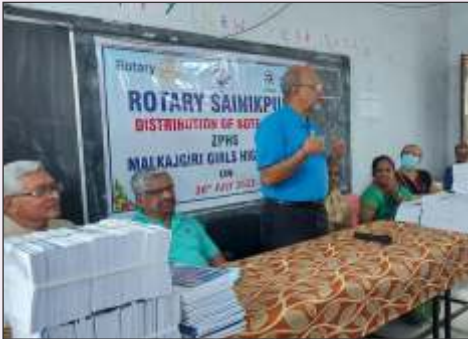
Distribution of notebooks RC Sainikpuri