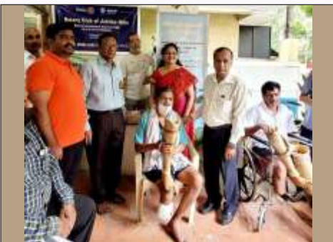
Distribution of 15 limbs RC Jubilee Hills RC Hyderabad Emeralds