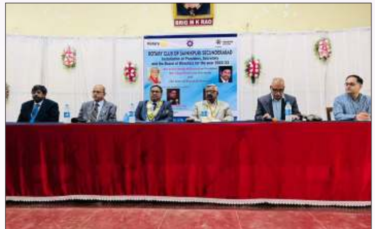
RC sainikpuri Secunderabad