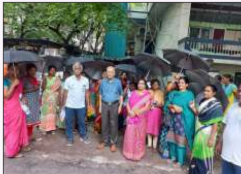
Distribution of food to the victims of Godavari flood RC In bhadra Sarapaka