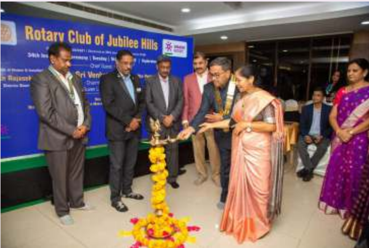
RC Jubilee Hills