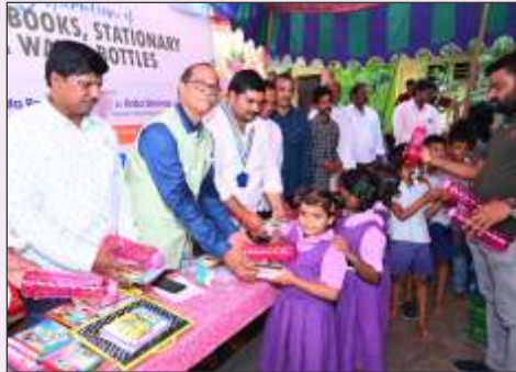
Distribution of notebooks & water bottles RC Tadepalli