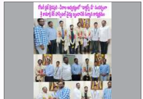
Honouring of Doctors RC Ksheerapuri Chirala