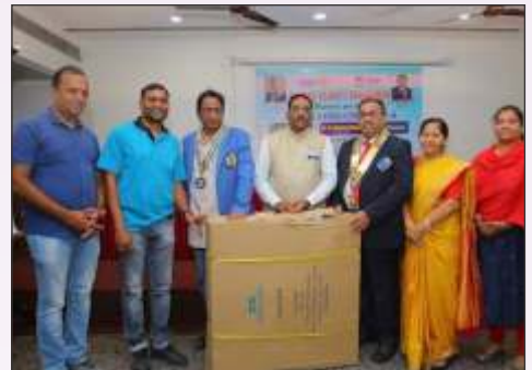
Donation of wheel chair Rotary Global Champions