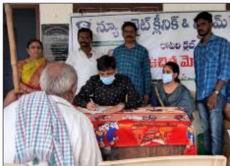
Mega medical camp RC Sattenapalli