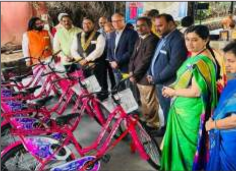
Distribution of 500 bicycles & 500 sewing machines RC Hyderabad North