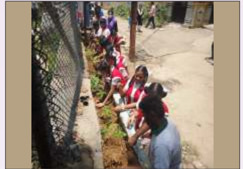
Tree plantation RC Smart Hyderabad