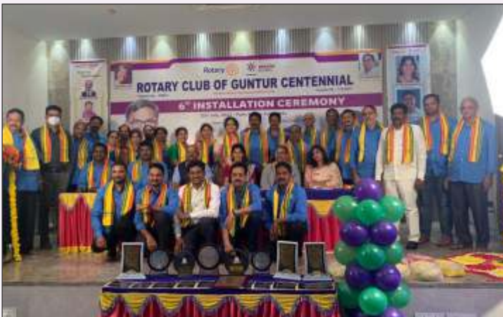
RC Guntur Centennial