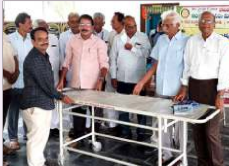
Donation of Stretchers RC Repalle Rural