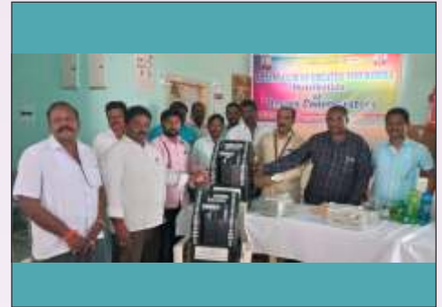
Distribution of Oxygen Concentrators RC Narasarao Peta