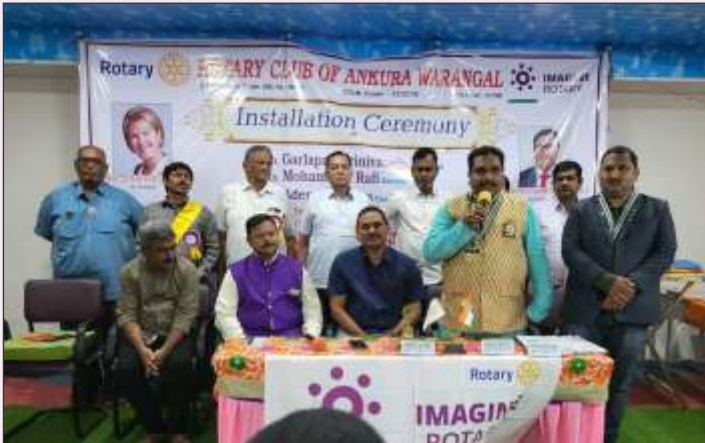
RC Ankura Warangal