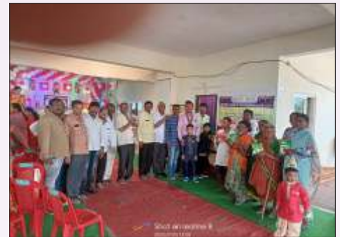
Distribution of Groceries RC Piduguralla Limecity