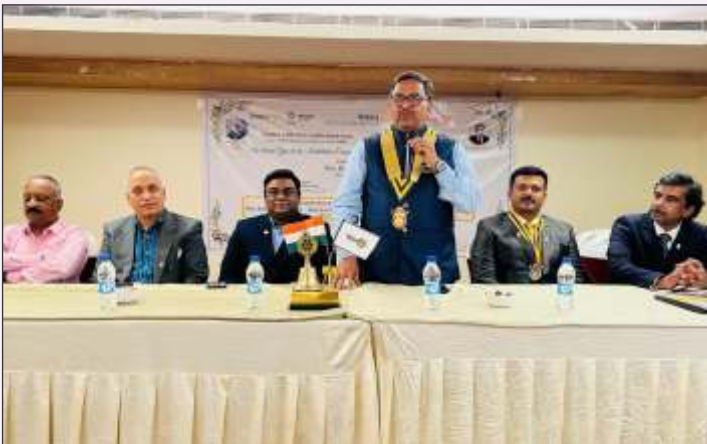
RC Secunderabad Icons