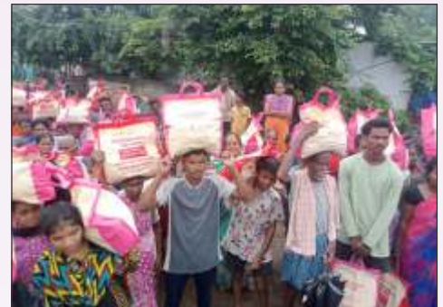
Godavari flood relief kits RCs Tadepalli & Mangalagiri