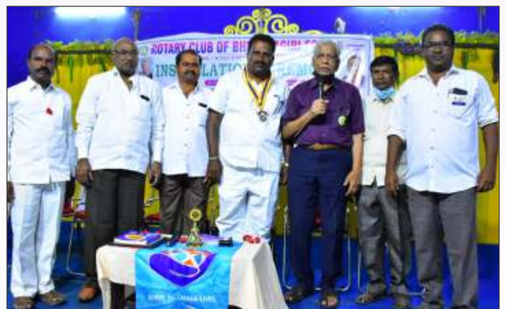
RC Bhongir Fort