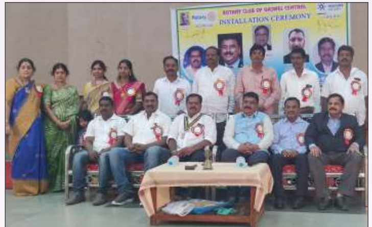
RC Gajwel Central