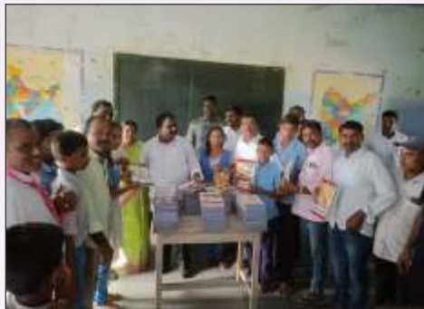
Distribution of Notebooks RC Warangal