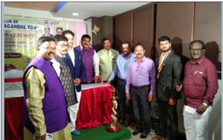
RC Karimnagar Fort