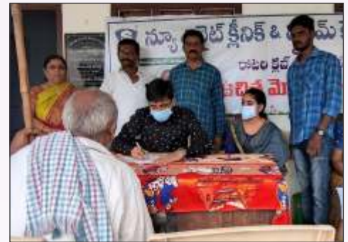
Mega Medical camp RC Sattenapalli