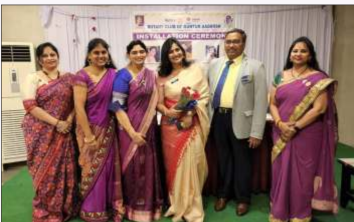
RC Guntur Adarsh