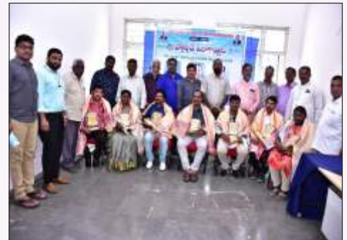
Honouring of doctors RC Bhuvanagiri