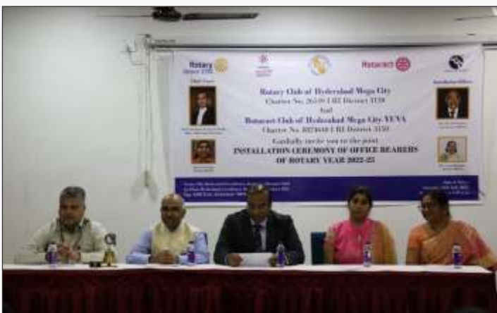
RC Hyderabad Megacity