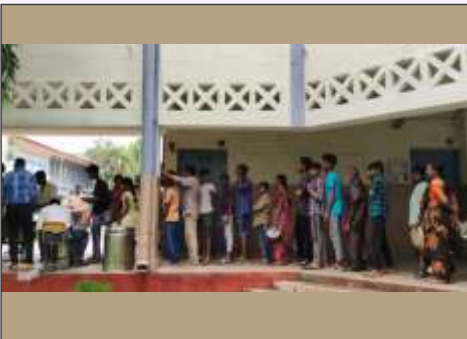
Distribution of food to the victims of Godavari flood RC In bhadra Sarapaka