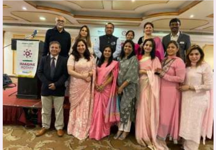
RC Hyderabad Pride