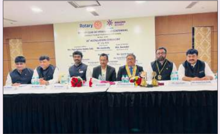
RC Hyderabad Centennial