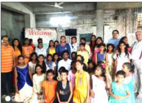
Distribution of Clothes, Steel handwash etc RC Secunderabad