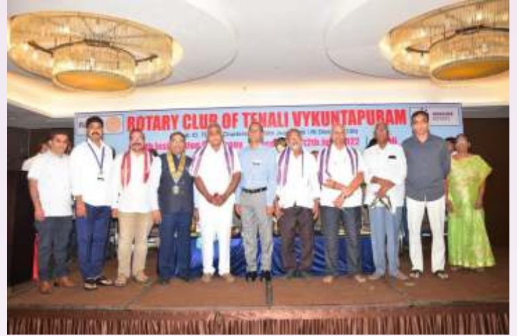
RC Tenali Vaikuntapuram