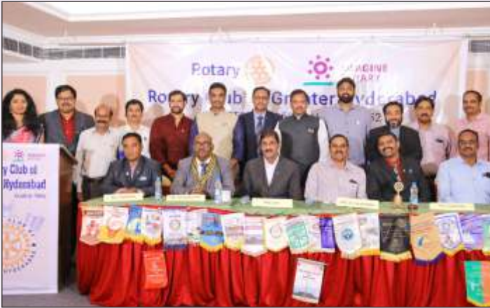
RC Greater Hyderabad