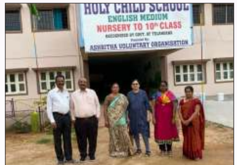
Adoption of a Government school RC Miyapur