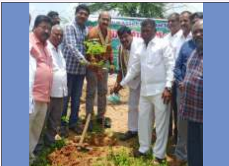
Tree plantations RC Kamareddy