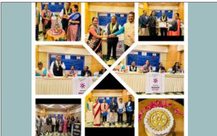
RC Hyderabad Crusaders