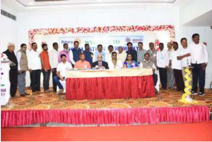
RC Manjeera Sangareddy