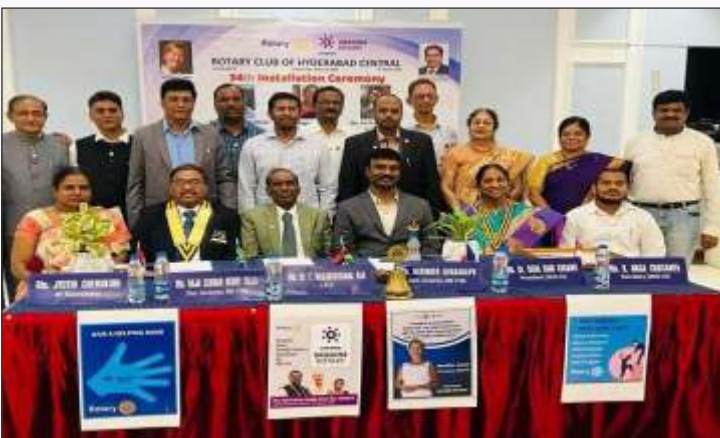
RC Hyderabad Central