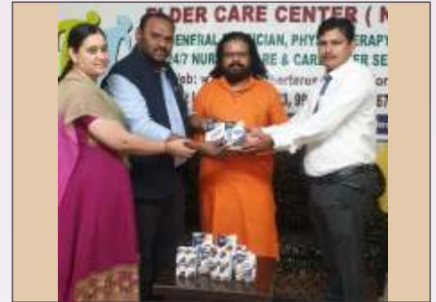
Distribution of Glucose testing machines & 20boxes of test kits