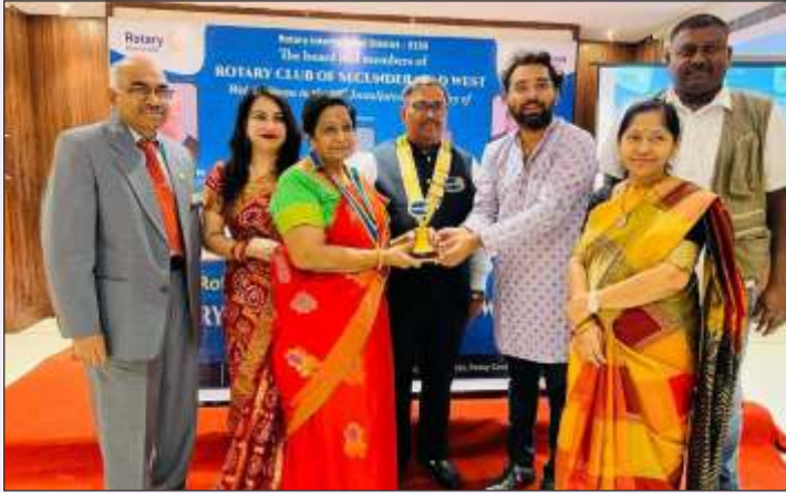
RC Secunderabad West