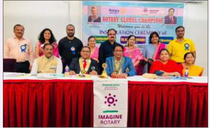
RC Global Champions