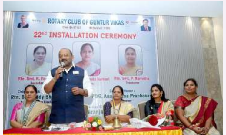
RC Guntur Vikas