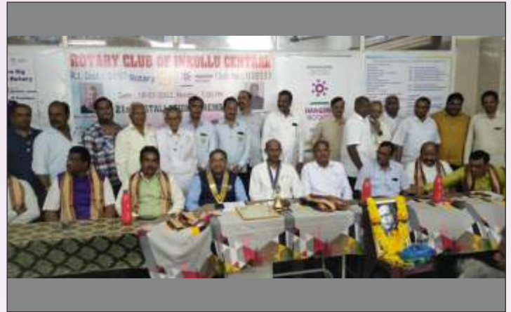
RC Inkollu Central