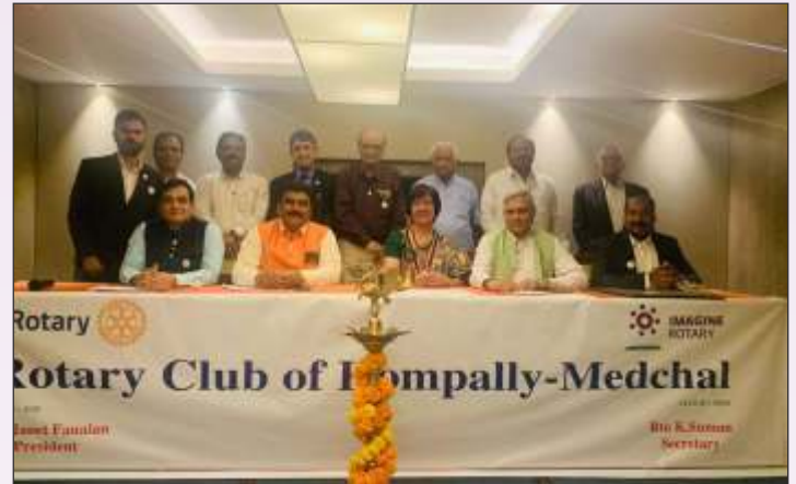
RC Kompally Medchal