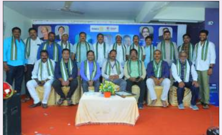
RC Ongole Central