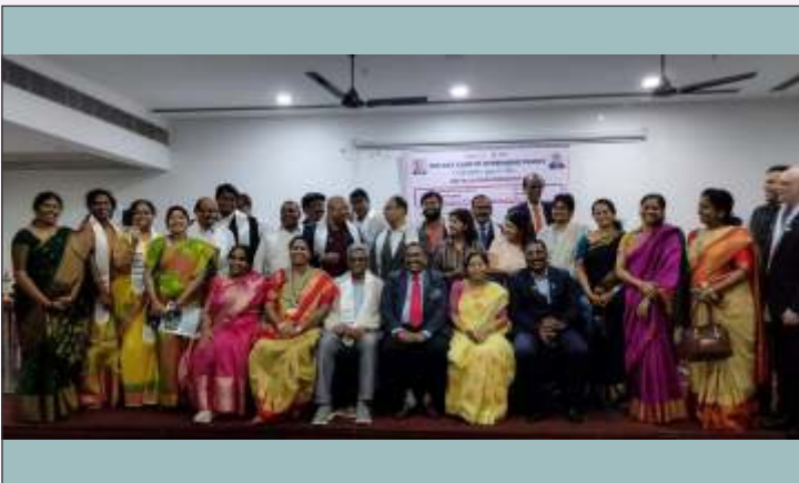
RC Hyderabad Pearls