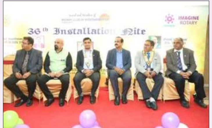
RC Hyderabad East