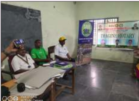
SAVE SOIL RC Pandaripuram