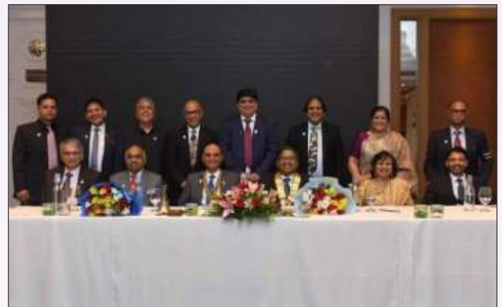
RC Hyderabad Deccan