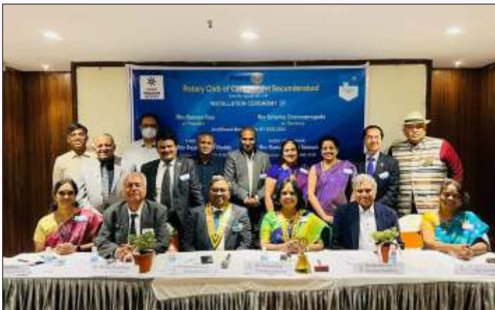
RC Cantonment Secunderabad