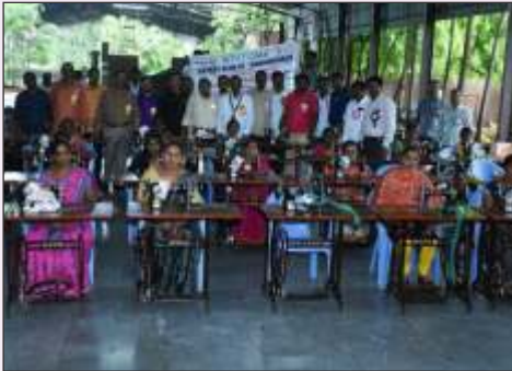
Distribution of sewing machines RC Mahabubabad