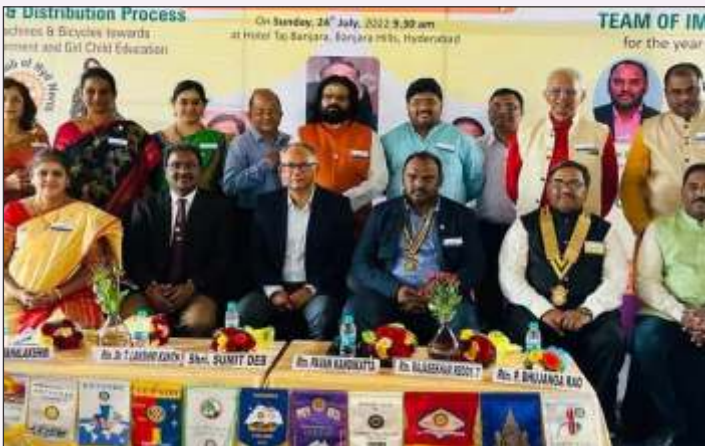
RC Hyderabad North