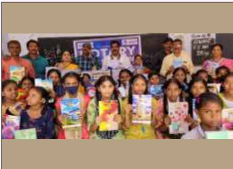
Distribution of books RC Hanamkonda