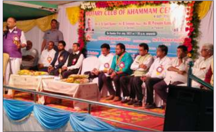
RC Khammam Central