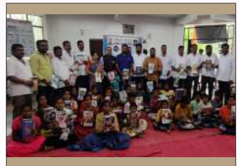
Distribution of books RC Gajwel