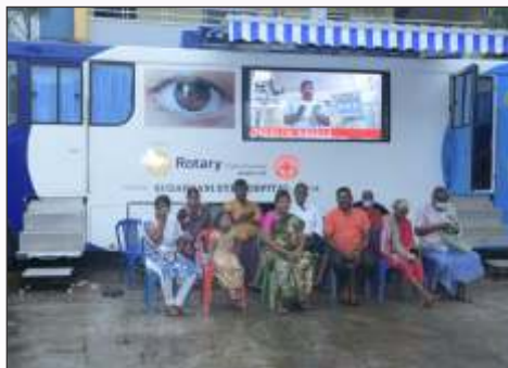
Mega Eye camp RC Guntur Achievers