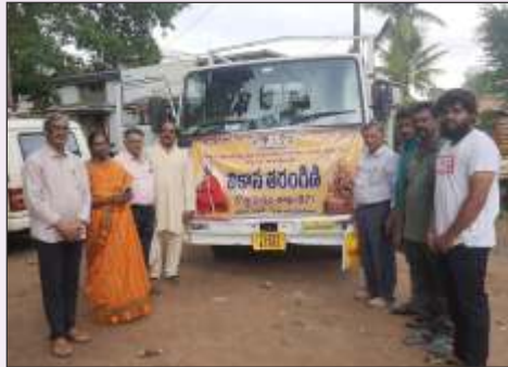
Godavari Flood relief help RC Kottagudem