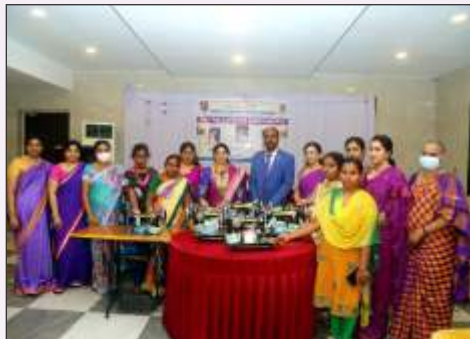
Distribution of Sewing machines RC Guntur Adarsh