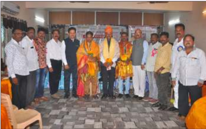
RC Piduguralla Limecity