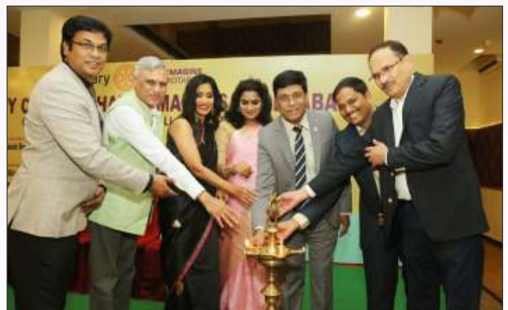
RC Change Makers