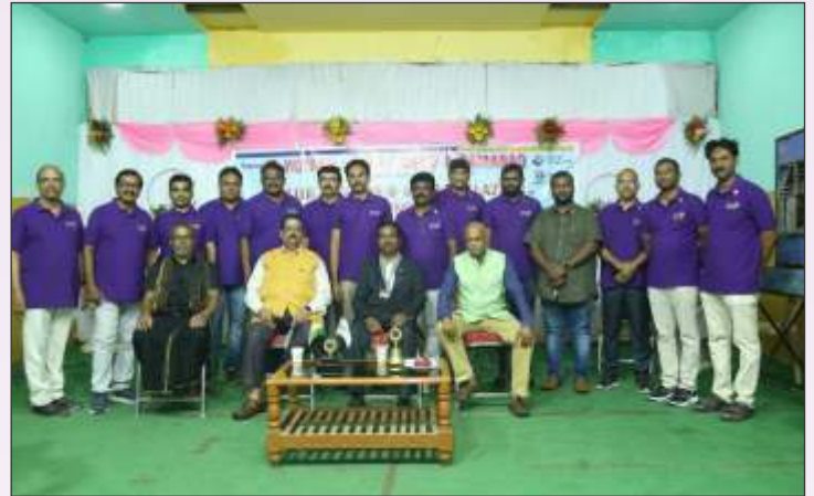
RC Gems Nizamabad