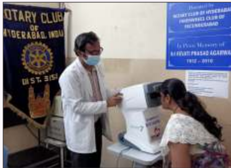
Eye checkup camp RC Hyderabad