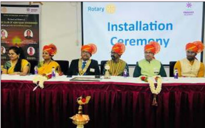
RC Hyderabad Abhyuday