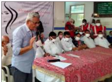
Cancer awareness program RC Chandanagar