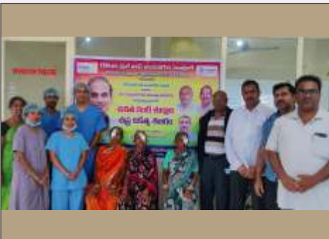
Free Cataract operations RC Bhuvanagiri Central